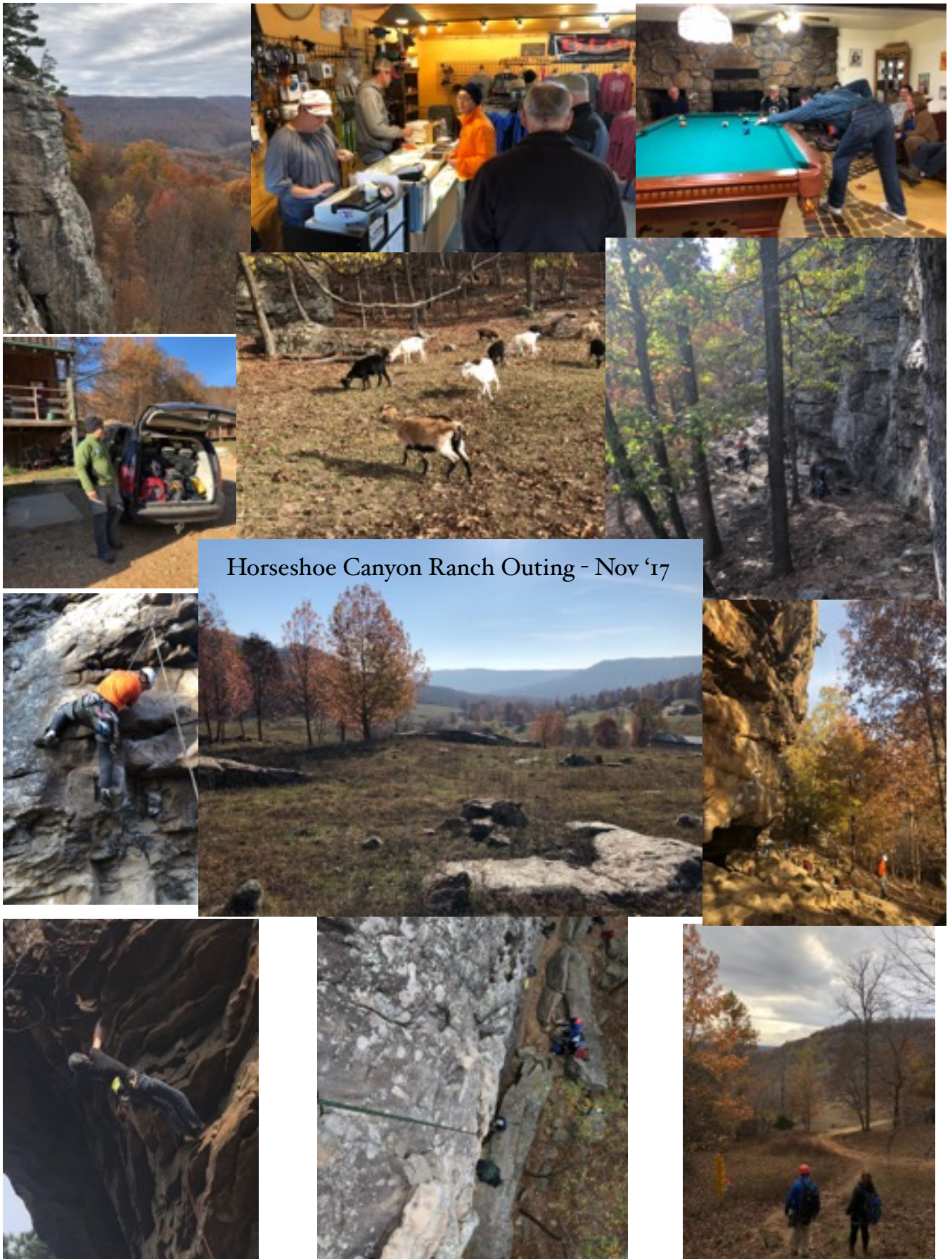
Horseshoe Canyon Ranch Outing - Nov '17